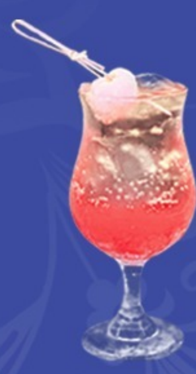
LYCHEE TEMPLE SODA