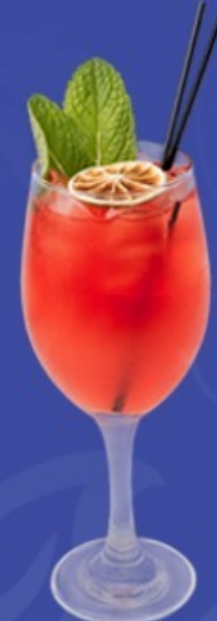
HIBISCUS TEMPLE SODA