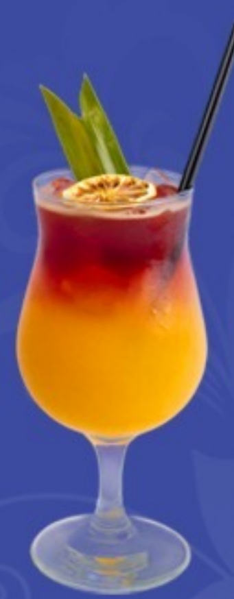
BUTTERFLY PEA MANGO