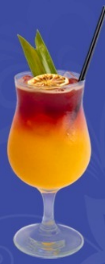
BUTTERFLY PEA MANGO