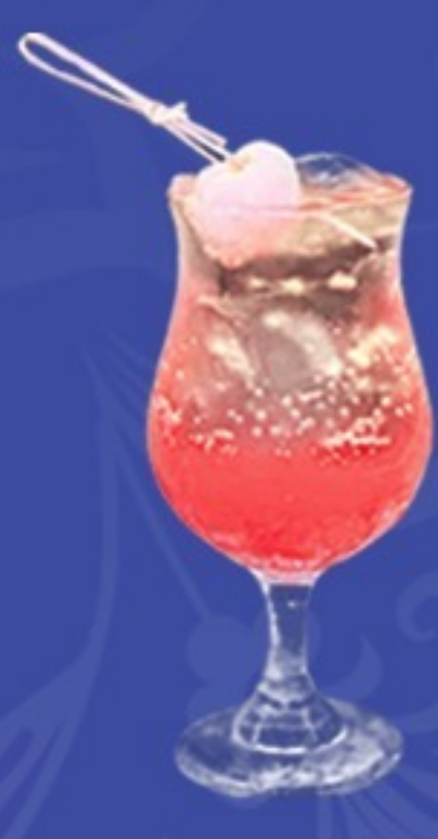
LYCHEE TEMPLE SODA