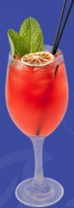
HIBISCUS TEMPLE SODA